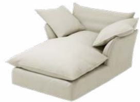
Loveseat Chaise 55in W x 67in D x 30.3in H 140cm W x 170cm D x 77cm H From $10,410