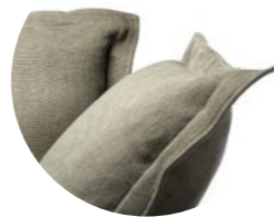
Song Pillow Edge Morion Grey Italian Linen

Song Loveseat | Pillow Edge Aquamarine Italian Linen 55in w x 41.3in d x 30.3in h 140cm w x 105cm d x 77cm h $8,010