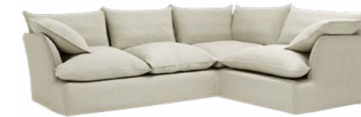
Corner Sofa | 2x3 Left or Right Side Available 122in W x 86.6in D x 30.3in H 310cm W x 220cm D x 77cm H From $21,240