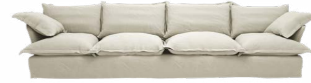
Extra Large Sofa 161.4in W x 41.3in D x 30.3in H 410cm W x 105cm D x 77cm H From $18,720