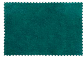
GRAINS OF PARADISE