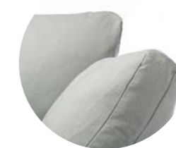
Otter Soft Edge Silver Birch Grey Italian Linen

Otter Armchair | Box Edge | Short Skirt Forest Velvet 45.3in w x 41.3in d x 30.3in h 115cm w x 105cm d x 77cm h $7,095