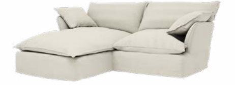
Chaise Sofa Left or Right Side Available 90.6in W x 68.9in D x 30.3in H 230cm W x 175cm D x 77cm H From $15,240