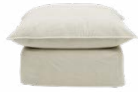
Footstool 33.5in W x 29.5in D x 30.3in H 85cm W x 75cm D x 77cm H From $3,330