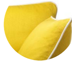
Marnie Contrast Piped Edge Agate with Selenite Italian Linen

Marnie Loveseat | Contrast Piped Edge Rose Quartz with Garnet Contrast Piping; Italian Linen 55in w x 41.3in d x 30.3in h 140cm w x 105cm d x 77cm h $8,010