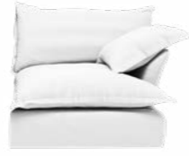
1 Seater 1 Arm Left or Right Side Available 45.3in W x 41.3in D x 30.3in H 115cm W x 105cm D x 77cm H From $5,670