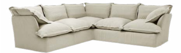
Large Corner Sofa | 3x3 122in W x 122in D x 30.3in H 310cm W x 310cm D x 77cm H From $24,840