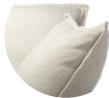
Song Short Pillow Edge Moonstone Italian Linen

Both the Pillow and Short Pillow Edges are styles that are uniquely Song and the look that launched a thousand jumps. Thanks to our easily removable and washable base and cushion covers, you can completely change the look and feel of your room with a simple change of cover.