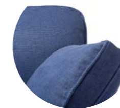
Otter Piped Edge Sapphire Italian Linen

A contemporary, formal look is the foundation of our Otter range. Featuring a different construction to both Song and Marnie, the cushions are made with a border or sidewall to provide support and shape that give a more boxy appearance. Both the Box Edge and Soft Edge styles are filled absolutely full of all the same natural comfort to be found in every one of our pieces.