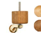
Castor Leg Oak or Walnut