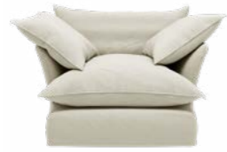
Armchair 45.3in W x 41.3in D x 30.3in H 115cm W x 105cm D x 77cm H From $6,210