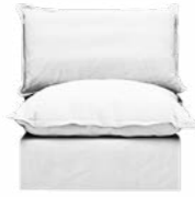
Single Bench 36.6in W x 41.3in D x 30.3in H 93cm W x 105cm D x 77cm H From $5,370