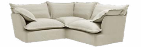
Corner Sofa | 2x2 86.6in W x 86.6in D x 30.3in H 220cm W x 220cm D x 77cm H From $17,640