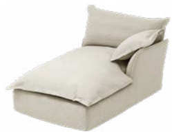
Chaise Longue Left or Right Side Available 45.3in W x 68.9in D x 30.3in H 115cm W x 175cm D x 77cm H From $9,450