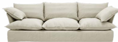
Large Sofa 126in W x 41.3in D x 30.3in H 320cm W x 105cm D x 77cm H From $15,090