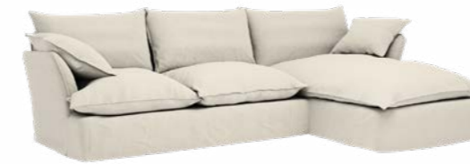
Large Chaise Sofa Left or Right Side Available 126in W x 68.9in D x 30.3in H 320cm W x 175cm D x 77cm H From $18,840