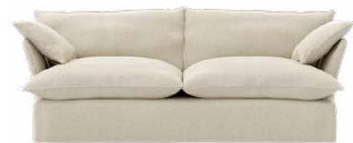
Medium Sofa 102.4in W x 41.3in D x 30.3in H 260cm W x 105cm D x 77cm H From $14,580