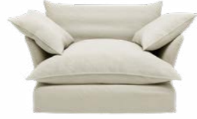
Loveseat 55in W x 41.3in D x 30.3in H 140cm W x 105cm D x 77cm H From $7,410