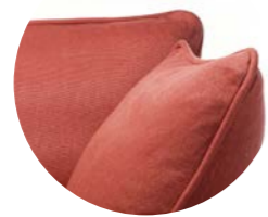
Marnie Piped Edge Ruby Italian Linen

Marnie's Piped Edge helps to exaggerate, highlighting the beauty of the pillow shape. We love how little pops of color on the edges can completely change the look. Feel free to choose piped colors that match, colors that complement, or colors that contrast or even clash; it's really up to you. We'll always share our favorites, but with our Marnie range, we are really looking forward to seeing endless combinations.