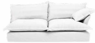
3 Seater 1 Arm Left or Right Side Available 80.7in W x 41.3in D x 30.3in H 205cm W x 105cm D x 77cm H From $9,330