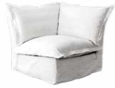
Corner 45.3in W x 41.3in D x 30.3in H 115cm W x 105cm D x 77cm H From $6,090