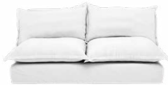
3 Seater Bench 74.8in W x 41.3in D x 30.3in H 190cm W x 105cm D x 77cm H From $6,570