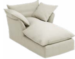
Armchair Chaise 45.3in W x 68.9in D x 30.3in H 115cm W x 175cm D x 77cm H From $9,810