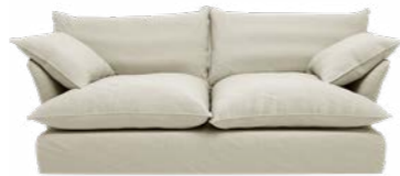
Sofa 88.6in W x 41.3in D x 30.3in H 225cm W x 105cm D x 77cm H From $11,340