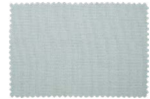
DUCK EGG BLUE